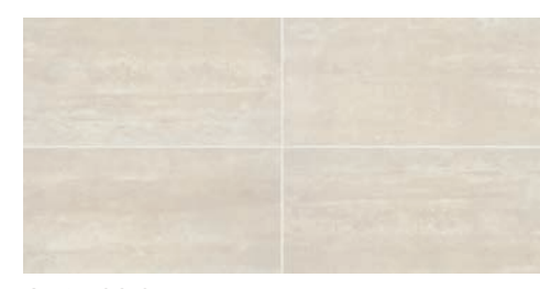
OFF WHITE CC08 BEIGE CC09 GRAY CC10