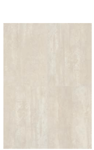
OFF WHITE CC08 BEIGE CC09 GRAY CC10